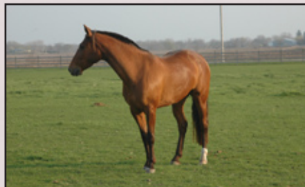
Saltadora UVF (Fandango D x Navarra UVF)

We limit our production of foals to make sure that we can individually work with and attend to each of their needs. Jay stables would like to breed the next generation of ambassadors for the Andalusian breed.