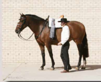
Escamilla (Centil x Ardorosa del Greco)