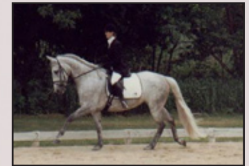
Divia G (Pregonero CGB x Bohemia Favory IXII)