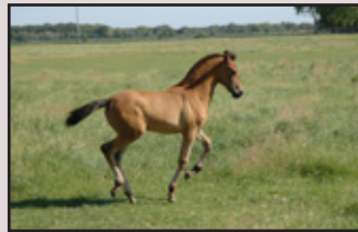
2006 Filly (Santiago x Escamilla)

Jay Stables has acquired mares with some of the best bloodlines available in the United States. We have been lucky enough to even find them in the coveted color of bay with the ability to produce black foals. In addition, many of our mares and their get can be registered in the Spanish studbook (PRE). Our philosophy in breeding is to produce an athletic, kind and correct foal that can go on to be a show competitor in many disciplines, into the breeding shed, or your next backyard best friend.